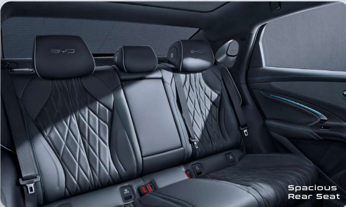
Spacious Rear Seat