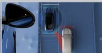
Predictive Collision Warning (Side)