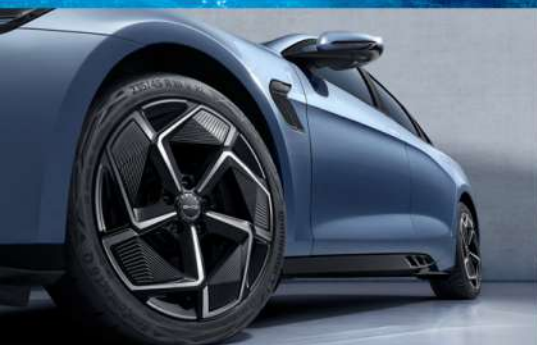
19-inch Large Wheel