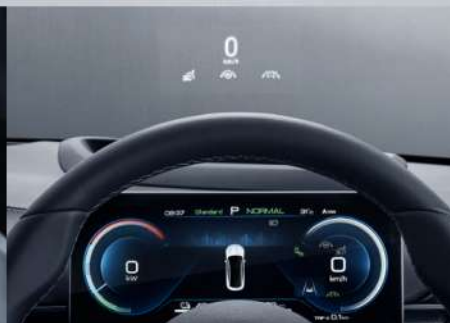
W-HUD Head-Up Display