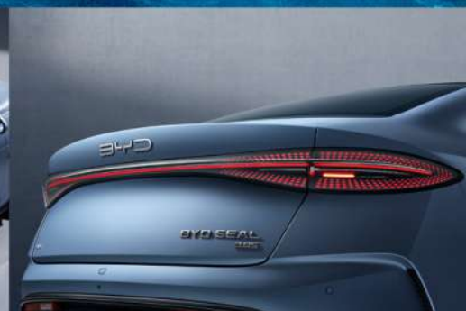
Boundless LED Tail Light