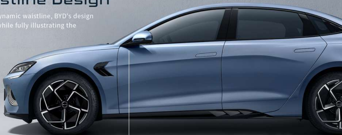
Waterdrop-Shaped Side Mirrors Inspired by the flowing design of the ocean

With its impressive and dynamic waistline, BYD's design reduces wind resistance while fully illustrating the fusion of sport and style.