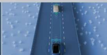
Adaptive Cruise Control Calibration