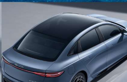
UV Resistance Double Glazing Panoramic Sunroof