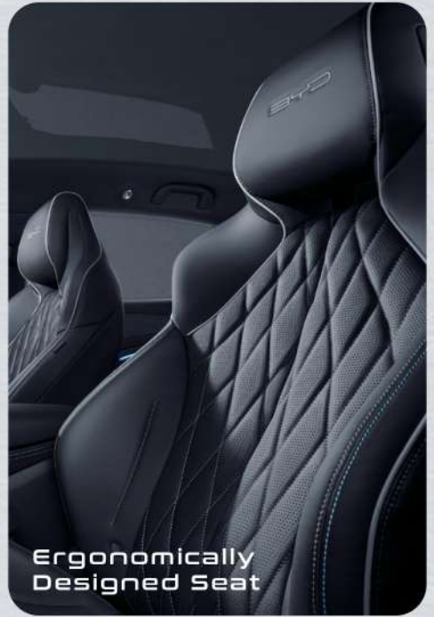
Ergonomically Designed Seat