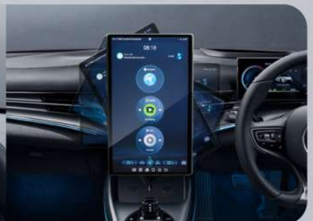
15.6-inch Rotating Screen (Supports Apple CarPlay® & Android Auto™)